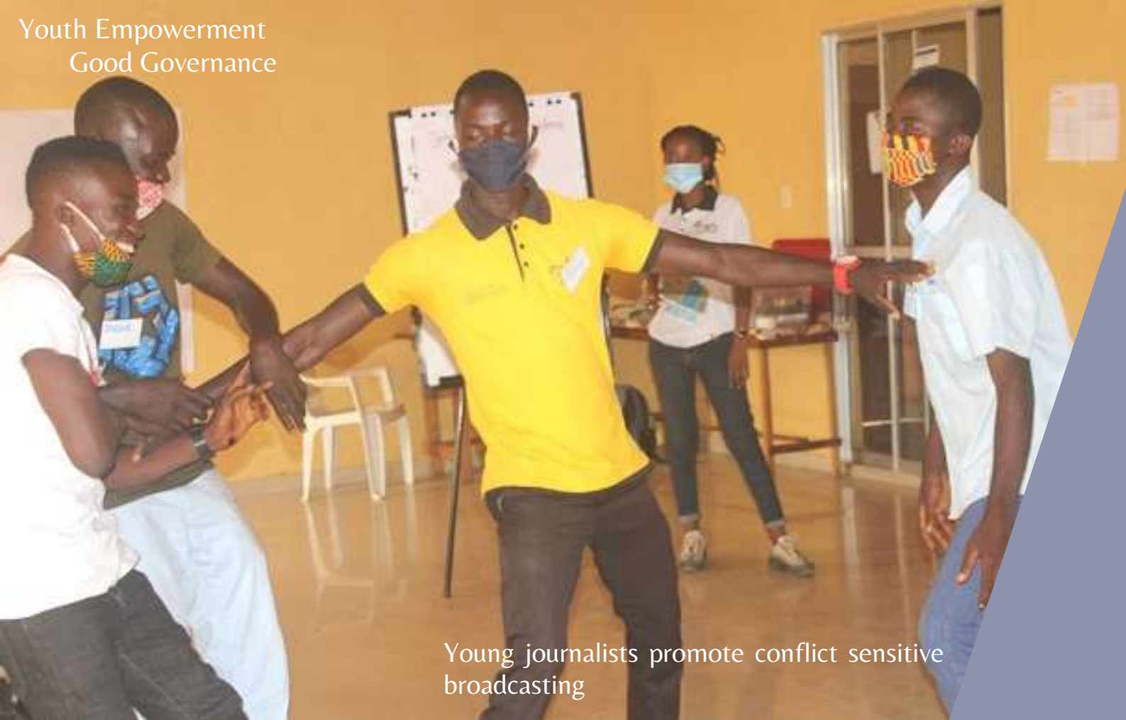
Young journalists promote conflict sensitive broadcasting