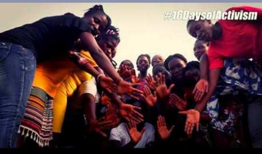
young female video trainees take on campaigns against Gender based violence in communities, through production of short videos and messages

During the period, the CPS was able to reach a target of 4,350 through the following activities; Campaigning against violence against women/girls, child trafficking awareness, YMCA Youth Peace Radio-Gbarnga trainings, peace Mediators Training, Peace Messages on billboards and public places, Video production and integrating participants as advocates and Training on gender mainstreaming and safe-guarding